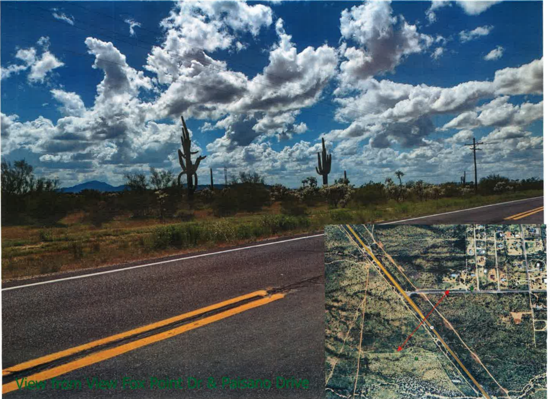
View from View Fox Point Dr & Paisano Drive