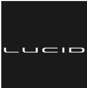
Lucid Motors Net Zero Producer