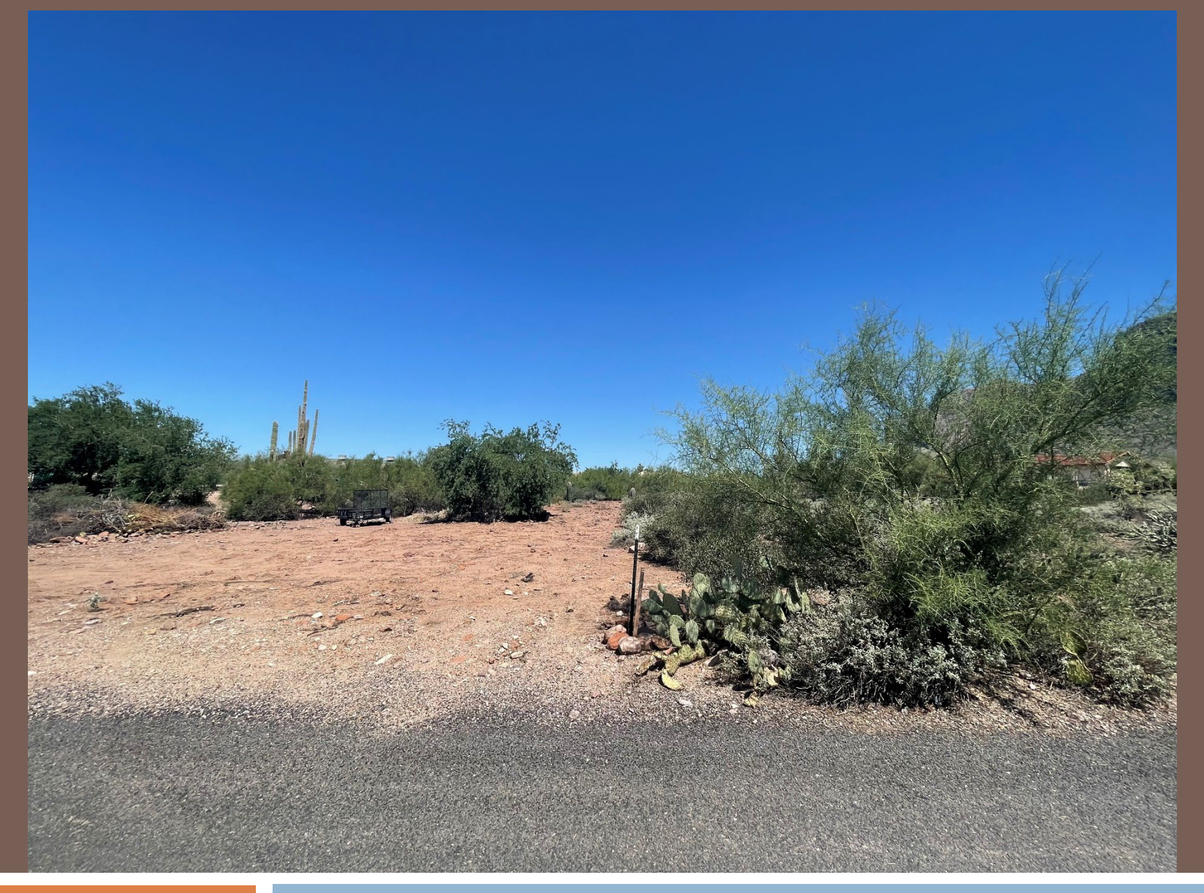
Looking North from Roundup St (couldn't not get to Manzanita alignment)