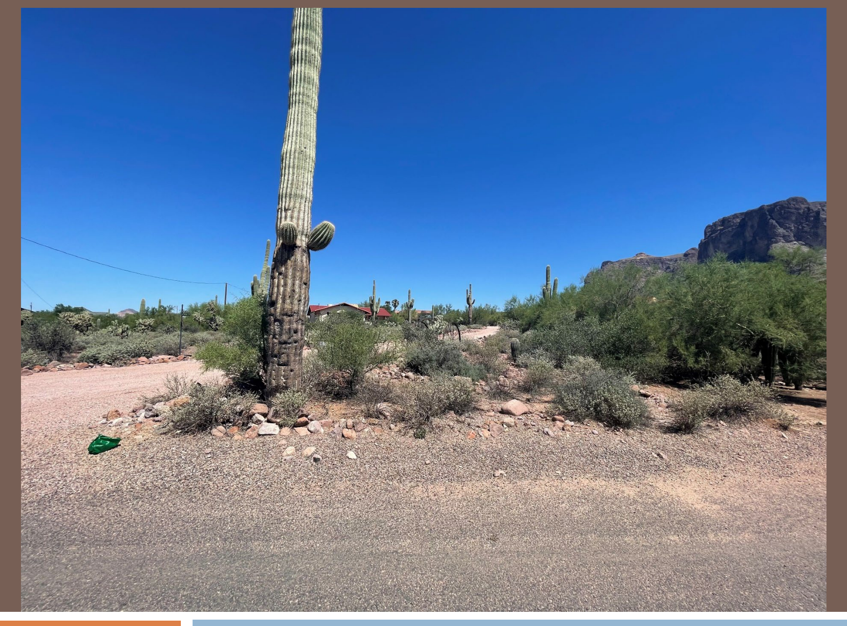
Looking North from Roundup St (couldn't not get to Manzanita alignment behind home visible)