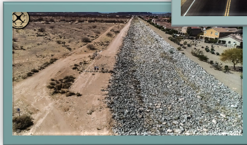
Magma Rd at Indigo Sky Blvd Project Before and After