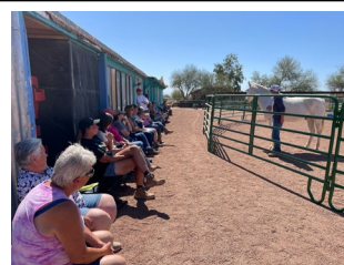
Participants taking notes and learning during one of our classes.