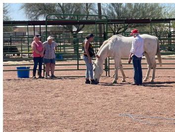
Participants getting ready for the hands on practice during class.