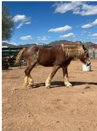
Big Hooves need soft ground that is dragged regularly.