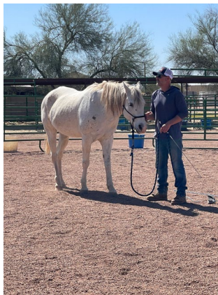
Quinlan training working with Ghost Rider during class.