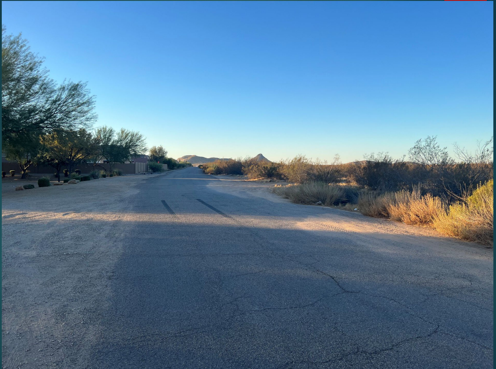
AT HUNT HIGHWAY LOOKING SOUTH