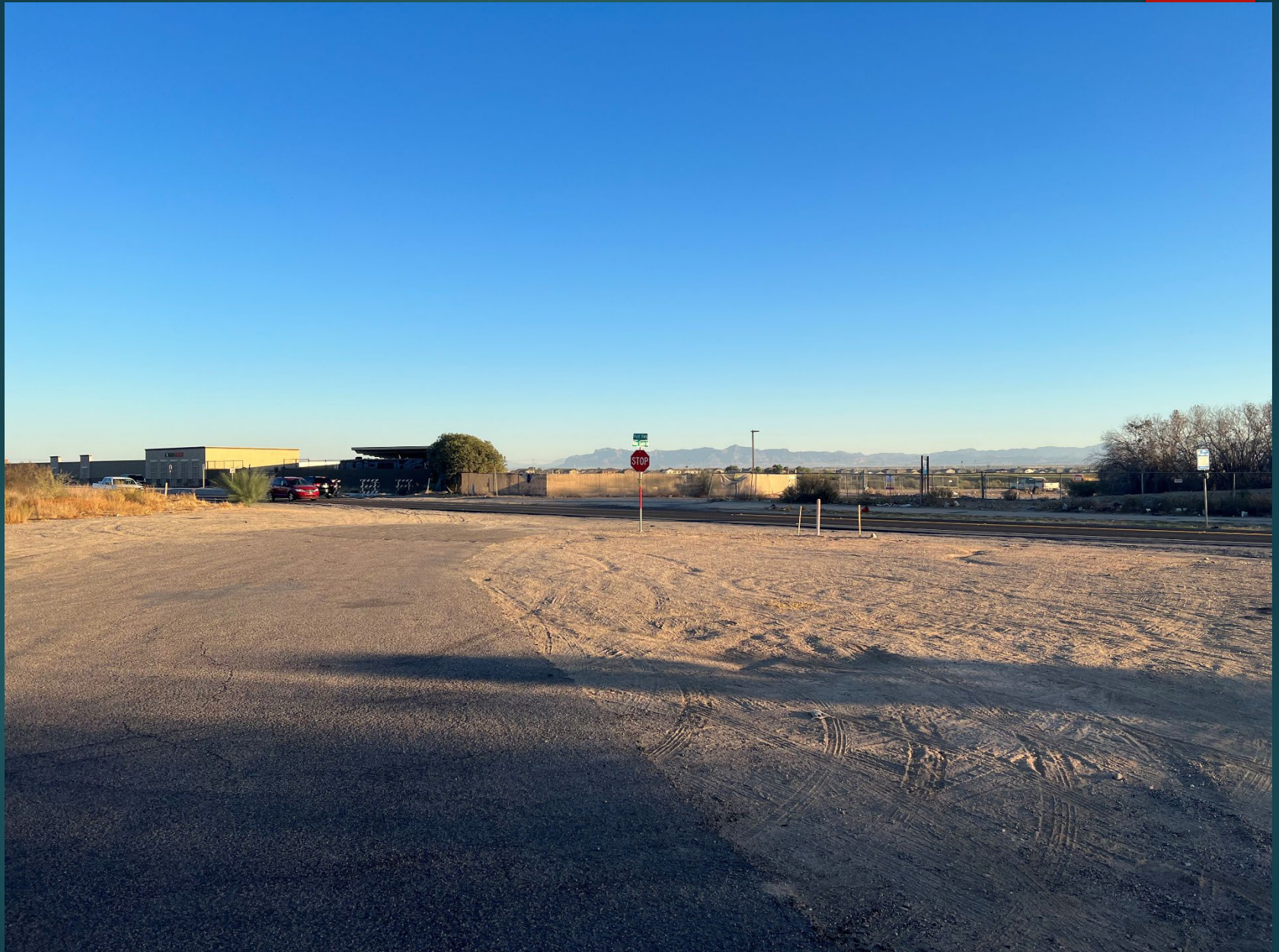
ON WALKER GRANITE LOOKING NORTH