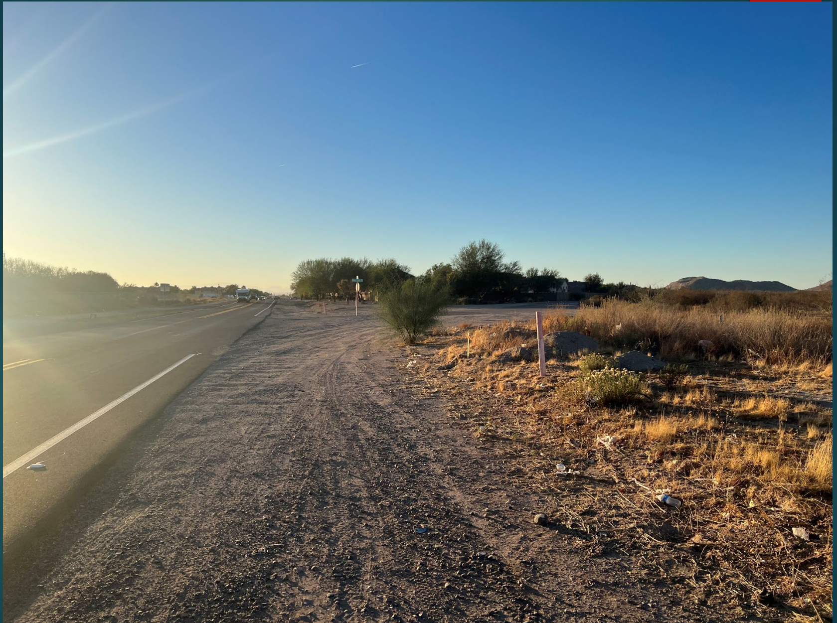
ON HUNT HIGHWAY LOOKING EAST