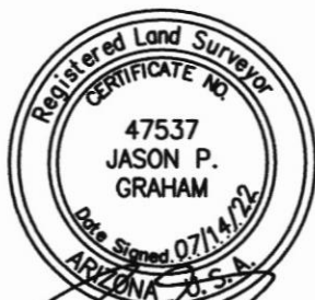
EXHIBIT "A" TEMPORARY CONSTRUCTION EASEMENT APN 104-27-004B

A PART OF SOUTHWEST 1/4 SECTION 21, T2S, R8E, GILA & SALT RIVER MERIDIAN, PINAL COUNTY, ARIZONA