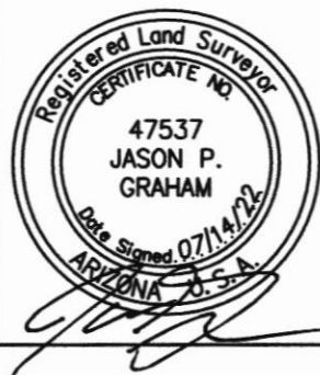
EXHIBIT "A" TEMPORARY CONSTRUCTION EASEMENT APN 104-27-004B

A PART OF SOUTHWEST 1/4 SECTION 21, T2S, R8E, GILA & SALT RIVER MERIDIAN, PINAL COUNTY, ARIZONA