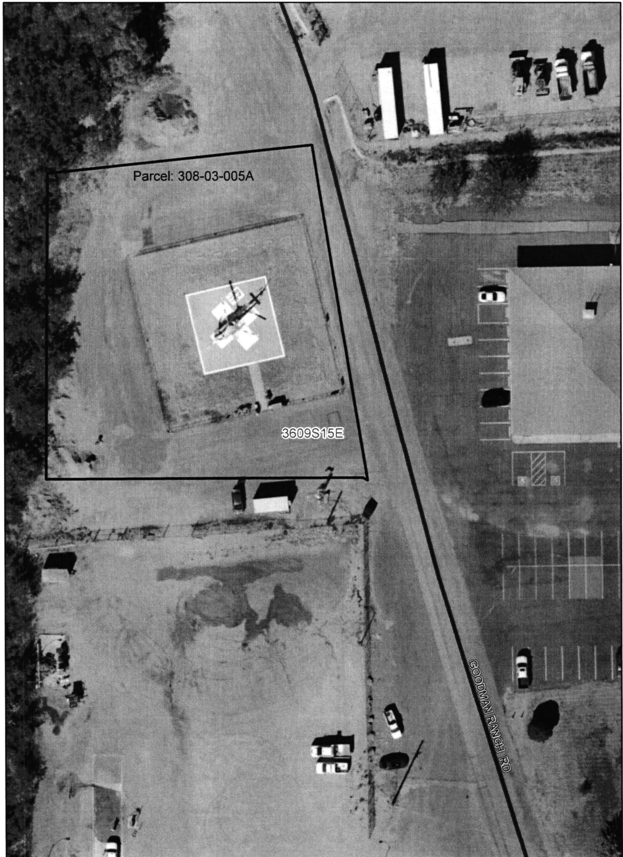
Exhibit A - continued