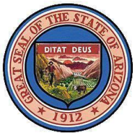
Douglas A. Ducey GOVERNOR