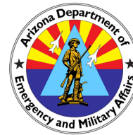
Major General Kerry L. Muehlenbeck THE ADJUTANT GENERAL

5636 East McDowell Road Phoenix, Arizona 85008-3495 (602) 267-2700 DSN: 853-2700